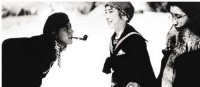
Silent Ozu: Days Of Youth