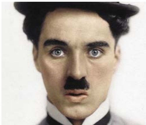
The Real Charlie Chaplin