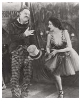
Sally of the Sawdust