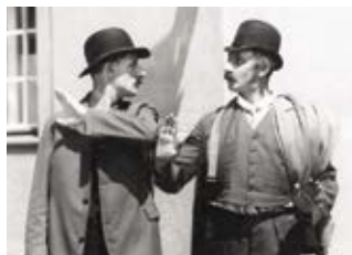
An Old Gangster Molls