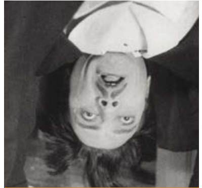
Be My Wife