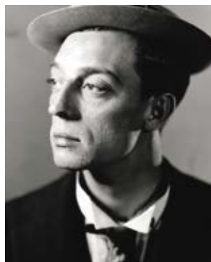
Conversations: Buster Keaton