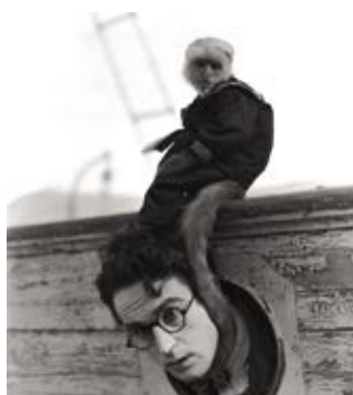
The Kid Brother