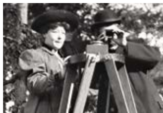
First Women in Comedy